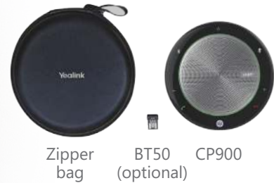
Zipper bag BT50 (optional) CP900